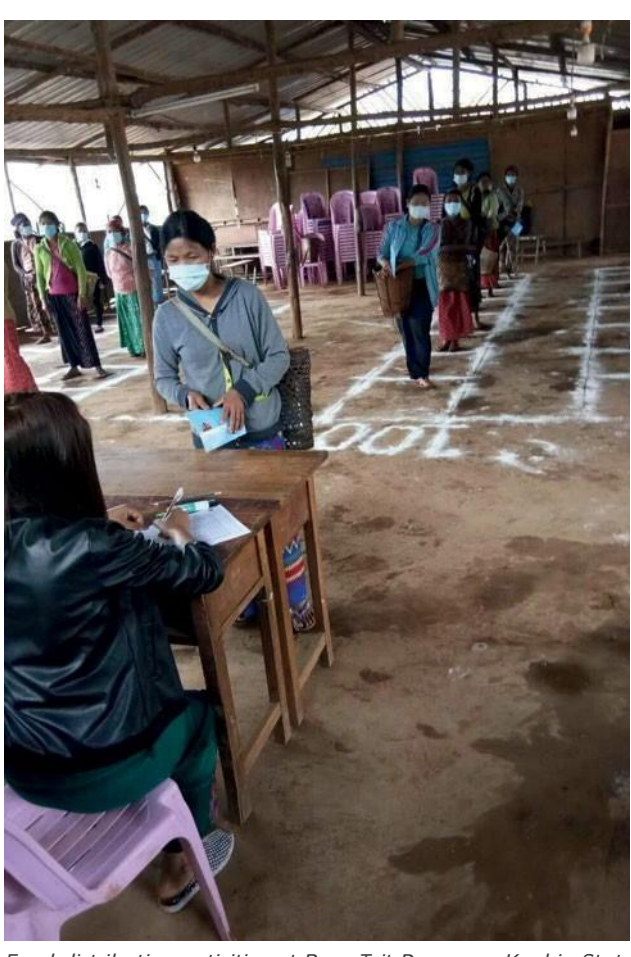
Food distribution activities at Bum Tsit Pa camp, Kachin State being managed with physical distancing measures in place

Trócaire have identified areas in which they feel KMSS will need more support or must manage more strictly in 2021, which they intend to share with their KMSS counterparts.