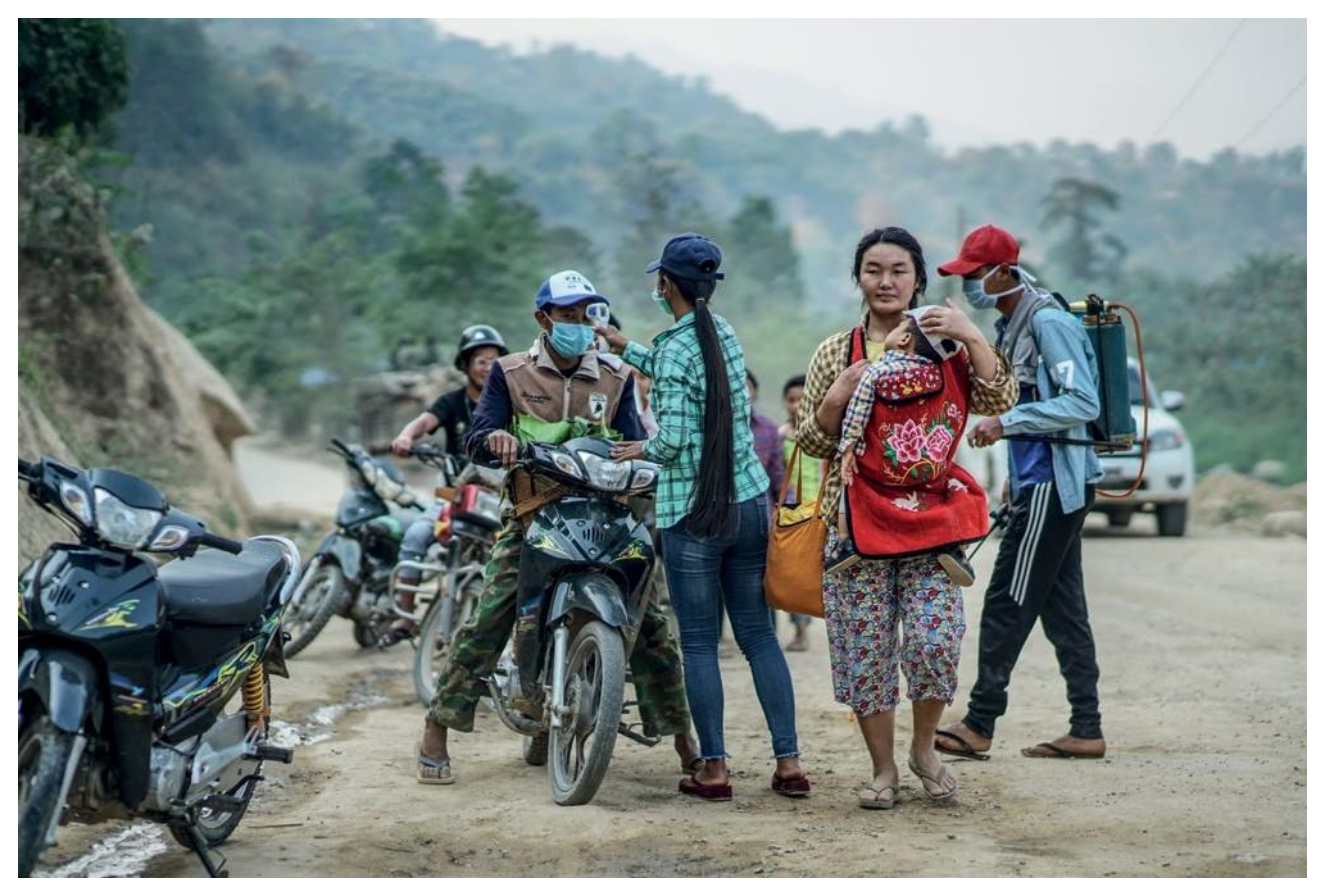
Volunteers at the Je Yang Camp, Kachin State conduct temperature checks as part of measures in place to safeguard against COVID-19