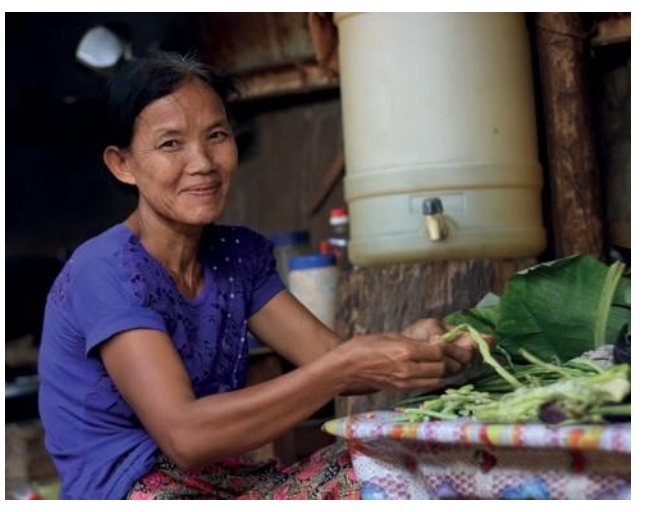
An IDP living in Je Yang Camp receiving support from the HARP-F-funded KMSS-Trócaire partnership project prepares a meal for her children

The increased prominence of KMSS in the localisation debate is linked closely to the profile of the national director, who will be stepping down at the end of 2020. To minimise the impact on KMSS's profile as well as its operations, a transition process for the new director has been ongoing. With greater focus on localisation, and increasing donor interest in supporting local partners, <sup>103</sup> KMSS is in a good position to expand its role within Myanmar's humanitarian community.