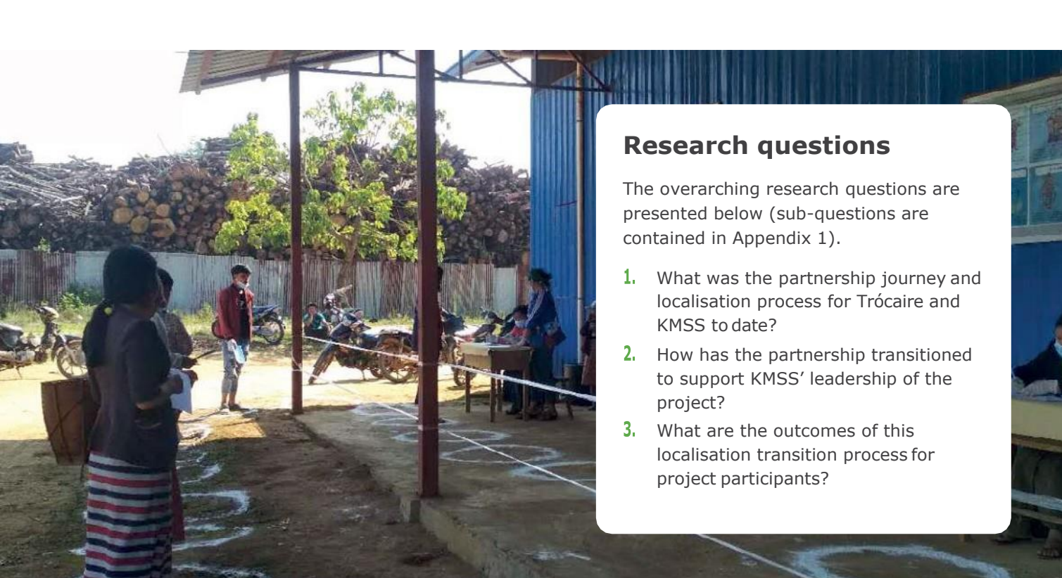
Distribution of food with COVID-19 safe physical disatancing measures in place at the Bum Tsit Pa camp, Kachin State

The localisation transition from 2012-2018 in 2019