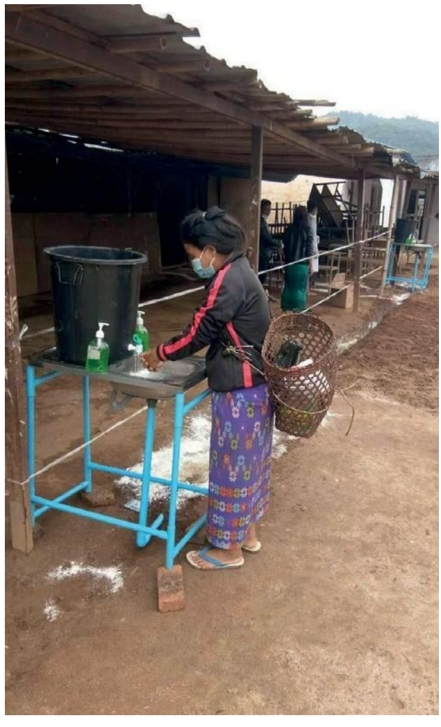
Hand washing before food distribution at Bum Tsit Pa camp, Kachin State

COVID-19 restrictions affected the MEAL process for KMSS, due to restrictions on travel and access to IDP camps. To address this problem, the KMSS team and the Trócaire MEAL advisor worked together to develop a strategy to transition MEAL activities into remote monitoring. This also included building in protection, safeguarding, inclusion and other considerations into the remote monitoring tools and processes.<sup>68</sup>